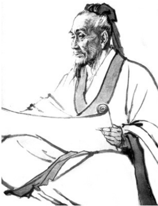
Zhang Zhongjing 150 - 219